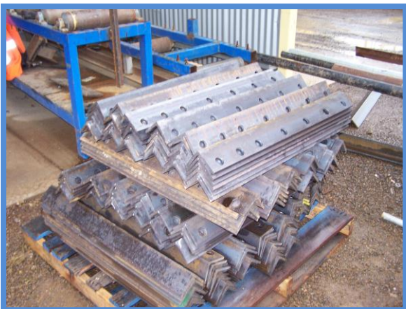
Of to the Galvanisers