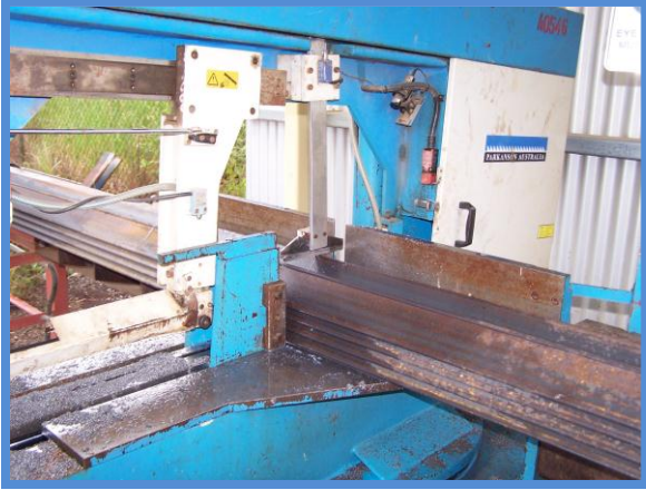
Above: The Parkinson Bandsaw makes short work cutting the angle iron 12 at a time

Jeff Hort Engineering has just started a major job manufacturing 1800 Galvanized Cable Brackets. The cable brackets are 900mm long x 90mm x 10mm thick angle iron. That represents 16.2 Kilometres of angle iron and 12,600 25mm holes weighing approximately 21 tonnes. The projected time line for this task is 7 working days.