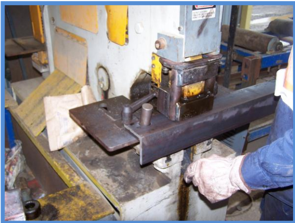
Above: As does the Punch and Shear 12600 holes later.